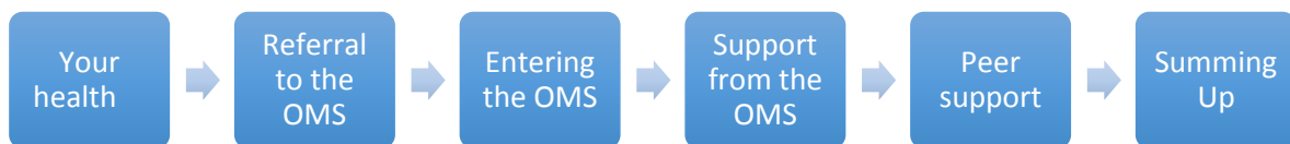
Figure 2: Stages in experience around which interview guides were based

The wheels and coding sheets for each participant can be seen in Appendix E. The wheels are organised into sections which reflect both the Service Journey through the OMS (See Figure 1, Section 3.2 ) and the stages in experience around which the interview discussion guides were organised. These stages are shown below at Figure 2 .