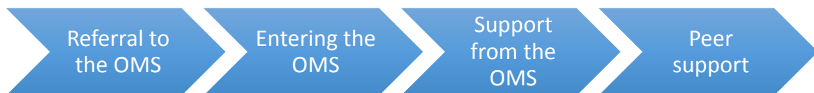
Figure 1: OMS Service Journey

The consumer narratives gathered through this process reflect a simple ideal journey through the OMS service, which is visually represented below. Peer support is specifically featured because this was an area of particular interest to ACT Health, and had been previously identified by OMS staff and consumers as an area where the service could be strengthened.